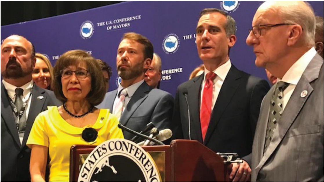
Mayor Eric Garcetti of Los Angeles announcing the C4C “America is Home” Initiative at the U.S. Conference of Mayors in Boston, June 2018

Lawful Permanent Residents were assisted with financial empowerment services lead by C4C cities and counties