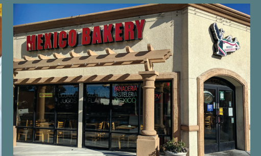
Melchor's Family Bakery in San Jose, CA