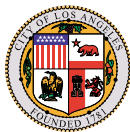
MAYOR ERIC GARCETTI