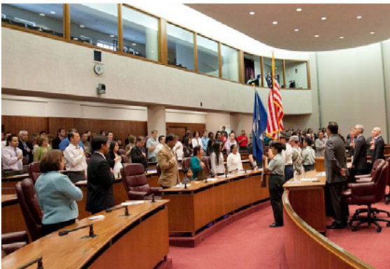
Chicago Mayor Rahm Emanuel at an Oath Ceremony in City Hall

"We want to make sure our residents have the resources they need to become naturalized citizens. By providing free assistance to residents in their native language, we can point them in the right direction so that they can continue on their path to citizenship and protect them from any risk of consumer fraud. Chicago is a city that was built by immigrants and continues to thrive from the vibrancy of our immigrant population, and we will do everything we can to support immigrants in their quest for citizenship." - Mayor Rahm Emanuel