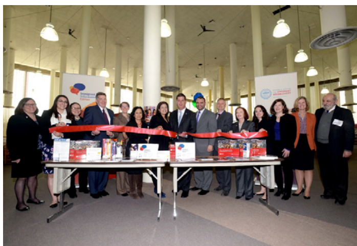
April 14th, 2016 - Boston Mayor Walsh launches Immigrant Information Corners at the Boston Public Library's Central Library in Copley Square and 24 neighborhood branches to provide information about resources and services available to help advance the well-being of the city's immigrant residents. Read more here .

In addition, the Mayor's Office for Immigrant Advancement collaborates with partners, such as Massachusetts Immigrant and Refugee Advocacy Coalition (MIRA) and Project Citizenship, to hold citizenship-related workshops, including a large application assistance clinic on Citizenship Day every September.