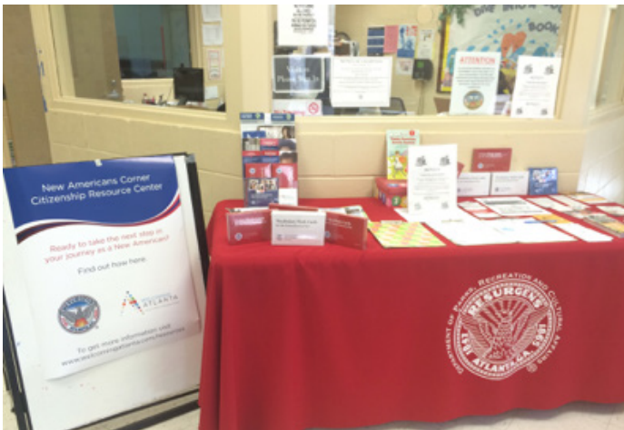
City of Atlanta's "Citizenship Resource Corner"

Promotion of citizenship and available related resources is done every single time a Welcoming Atlanta representative speaks to the media. This past year Welcoming Atlanta and citizenship resources have been highlighted in five separate media interviews and in a Citizenship Public Service Announcement that runs on a local channel once a month.