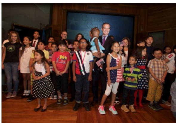
LA Mayor Eric Garcetti Children's Naturalization Ceremony, September 17, 2015

Step 6: Provide access to the library community rooms for non-profit organizations so they can host Citizenship and English language workshops on-site.