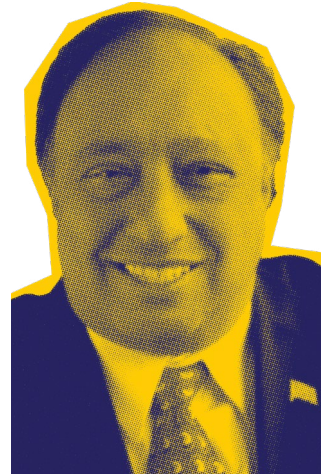
JOHN CATSIMA- TIDIS

Billionaire owner of Madison Square Garden