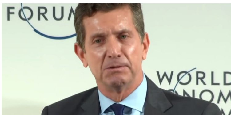
Alex Gorsky