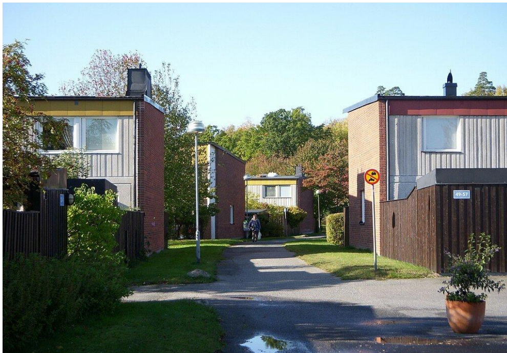
Public housing in Sweden.

Private landlords own 3,500 units in Botkyrka. The percent of privately-owned apartments in Stockholm is rising, it's scary.