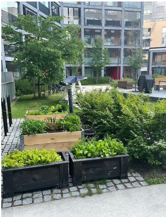
The “winter garden.”

“I think we have a pretty good system here in Finland now... It gives many people the chance to live in the city-center with more affordable apartments.”