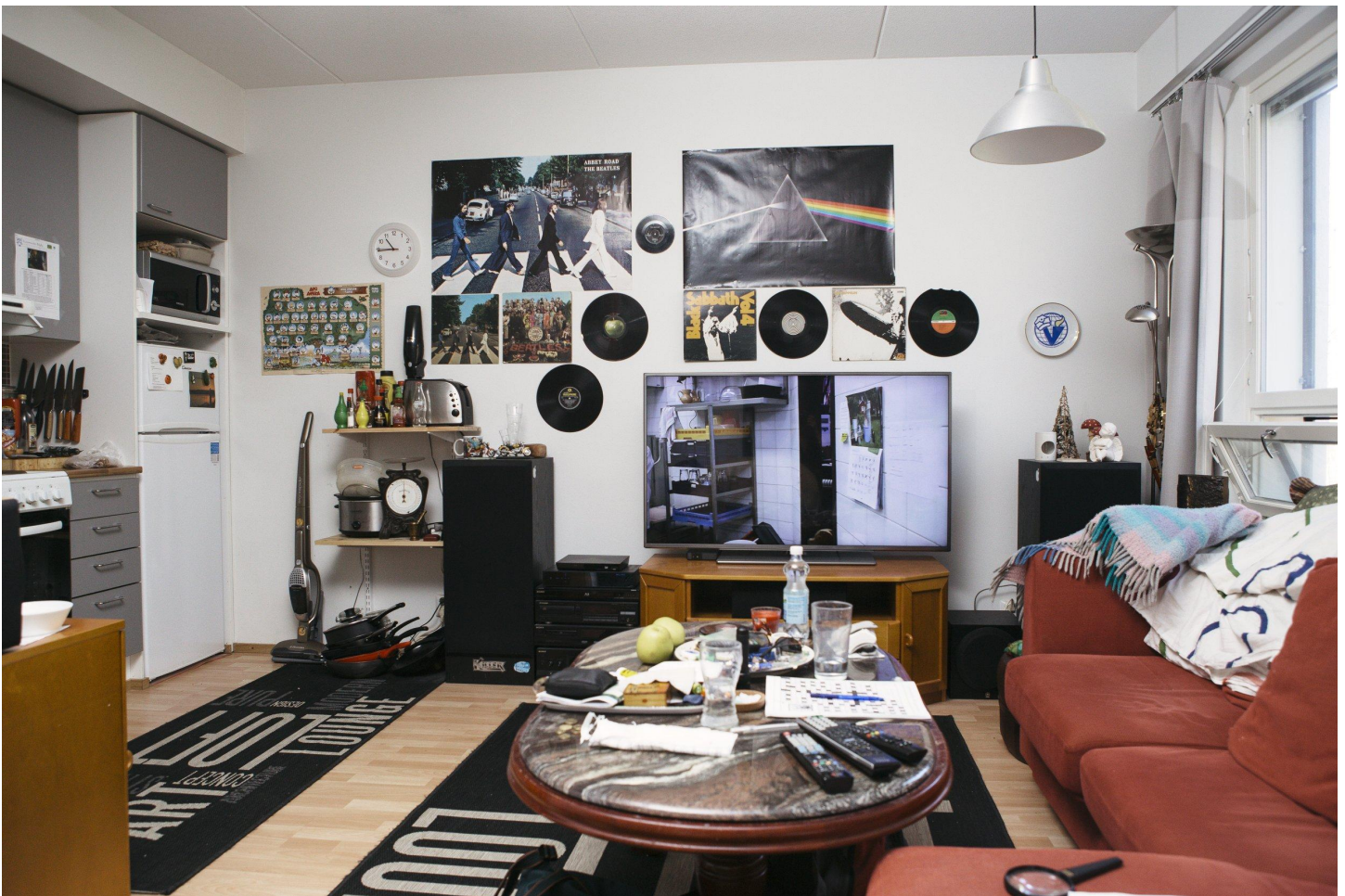
An apartment in Vainölä, a social housing development for formerly unhoused people in Espoo, Finland.