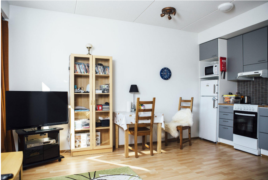
An apartment in Väänölä, a social housing development for formerly unhoused people in Espoo, Finland.