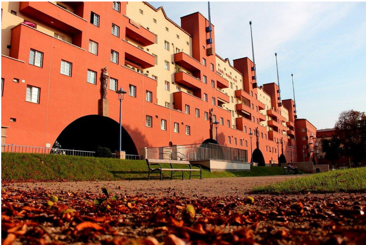
Karl-Marx-Hof, a social housing project in Vienna built by its city council in 1927-30, with over 1,300 units, gardens, and balconies. Its premises have included nurseries, a youth center, advice center for mothers, library, post office, dental and health clinics, pharmacy, shops, eateries, meeting rooms, and more.

The city's social housing program got its start during a period known as "Red Vienna" when, in the 1920s and early 1930s, a vibrant tenant movement elected socialists to power. Responding to widespread slum conditions and a war refugee crisis, the city constructed 65,000 quality public housing units – financed by imposing new luxury taxes on private villas, cars, domestic services, and high-end consumption. 7