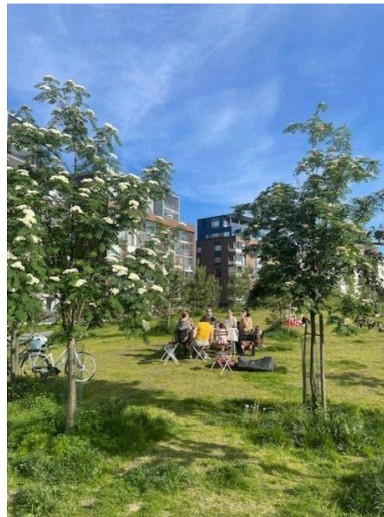
Communal spaces in the social housing project where Vesala lives.