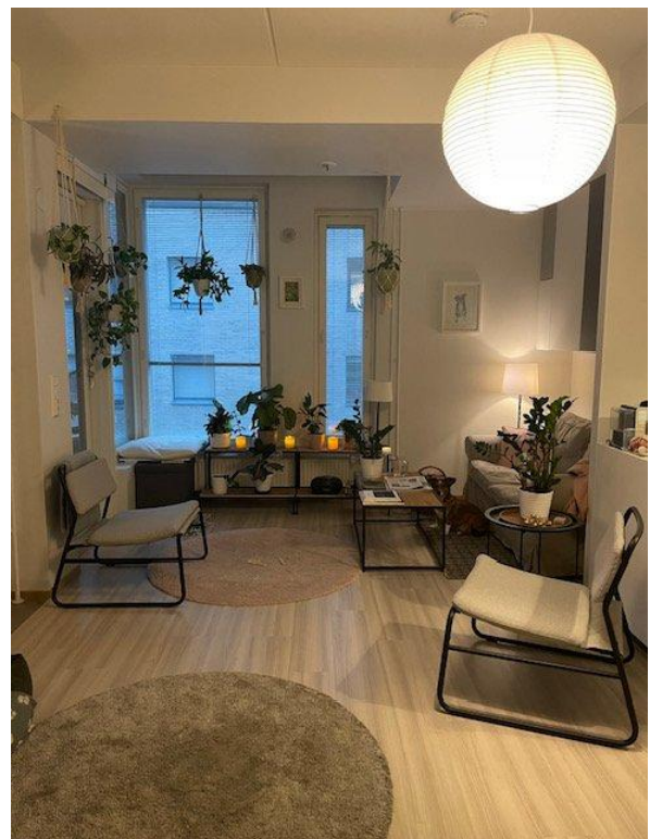
Vesala’s apartment in the social housing project.